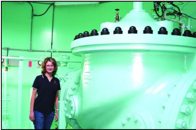
36" Pressure Reducing Valve Station Warren, Michigan