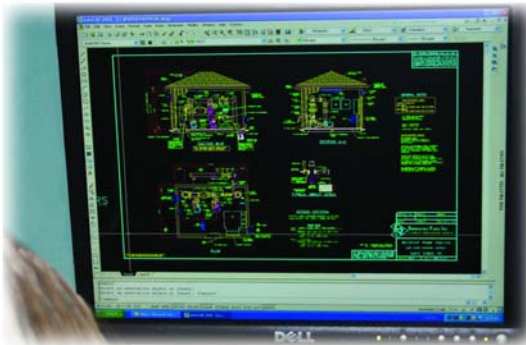
Integrated Product Development