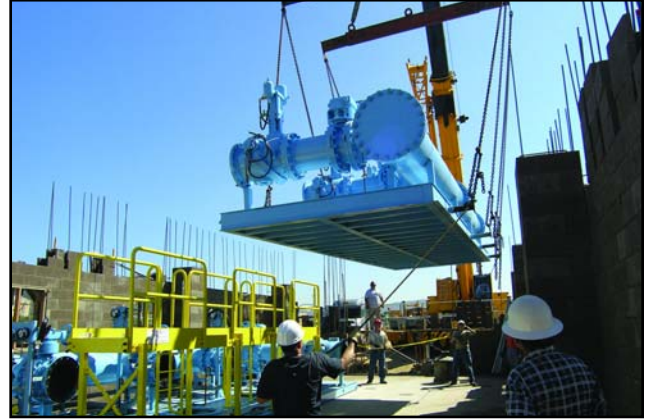
15.8 MGD Water Transfer Station Olivenhain, California