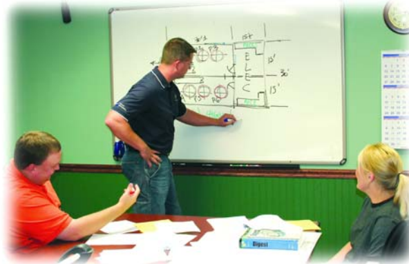
Intelligent Conceptual Design

One Integrated Solution - Single Responsibility