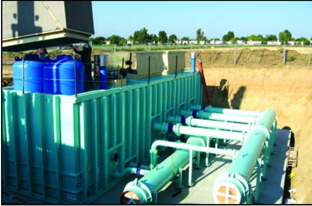
31.6 MGD Booster Station Thornton, Colorado

EFI's quality standards assure years of dependable service. Quality at EFI is not a slogan. Quality is designed and built into everything we do; it is our creed.