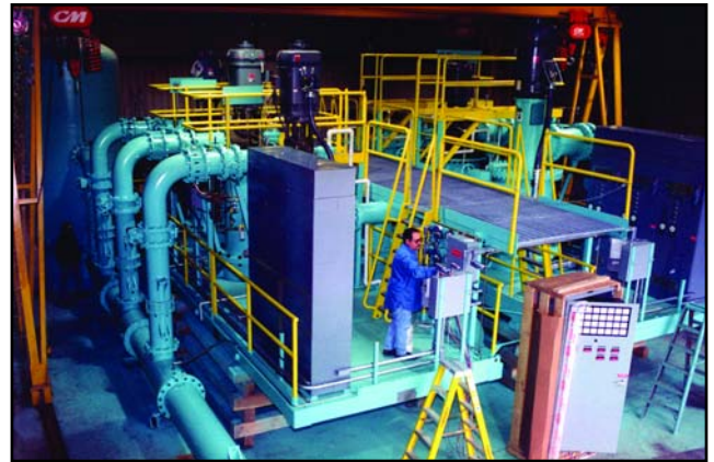
42 MGD Pump Station Henderson, Nevada

Integrated, Factory-Built Pumping, Metering and Control Systems